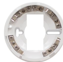
ProFyre Deep Common Base