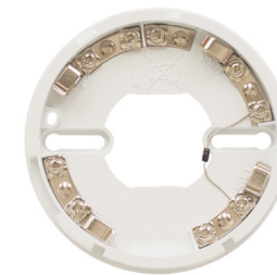
ProFyre Diode Base

The Detector Base range is fully compatible with the ProFyre addressable and conventional detector range.