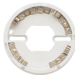
ProFyre Common Base